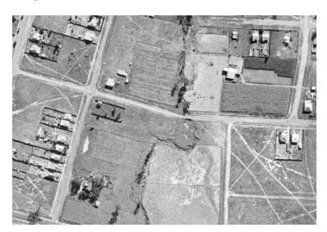
Our Garden circa 1943.

Perhaps you could grow some of the Open Day produce in some or all of your garden space between now and the beginning of October? Talk to Maureen or Robyn if you think you might be able to help.